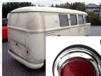
Repro Barndoor taillights