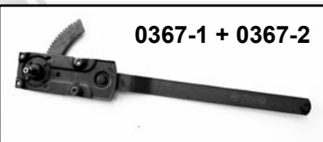
0367-1 + 0367-2